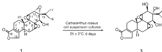
FIGURE 1 Transformation of triptolide by cell suspension cultures of Catharanthus roseus .

products. However, structural modifications of 1 and 2 by biological methods have not been reported so far.